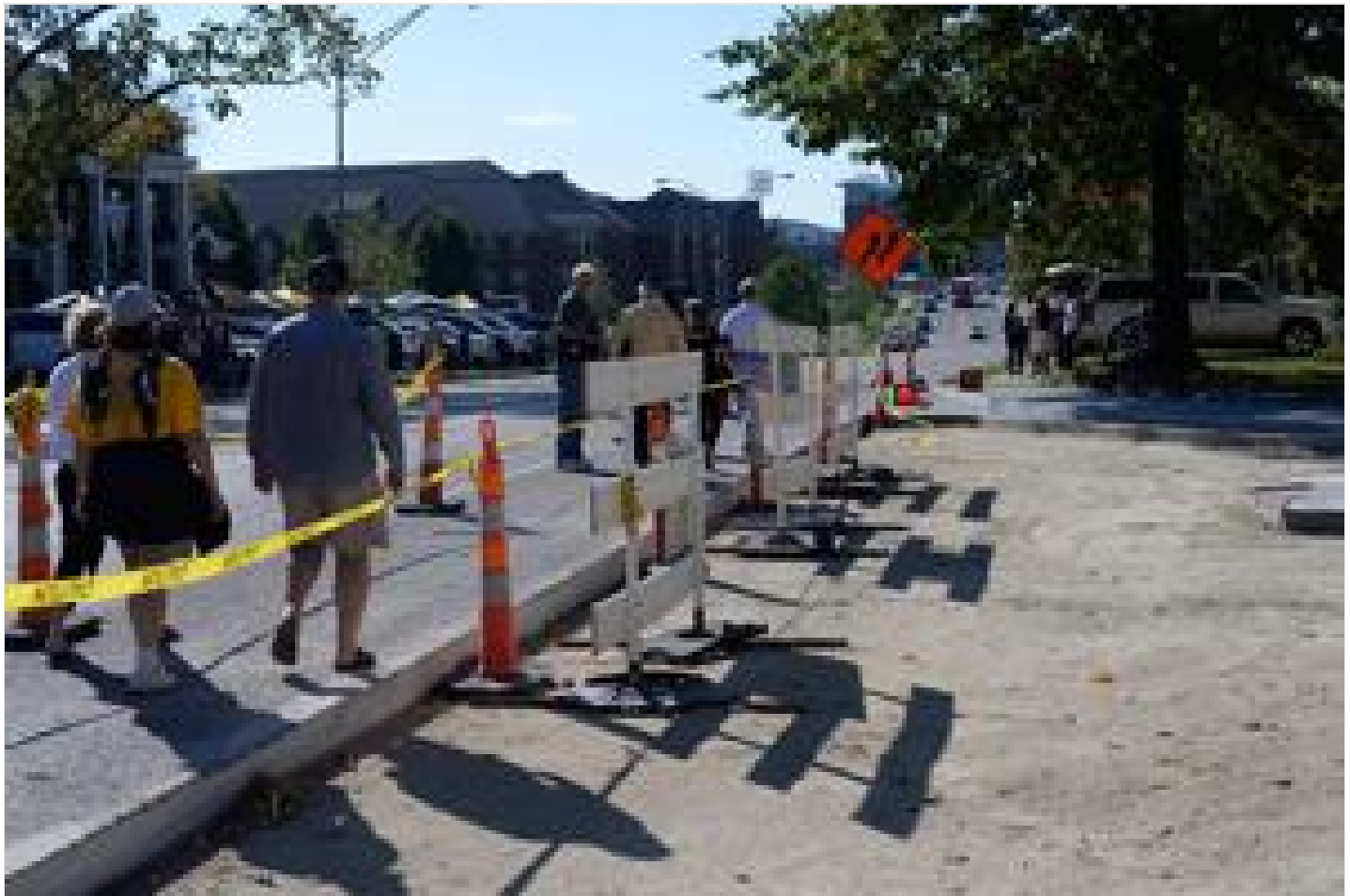
Providence Road construction nearly finished, but residents have grown weary